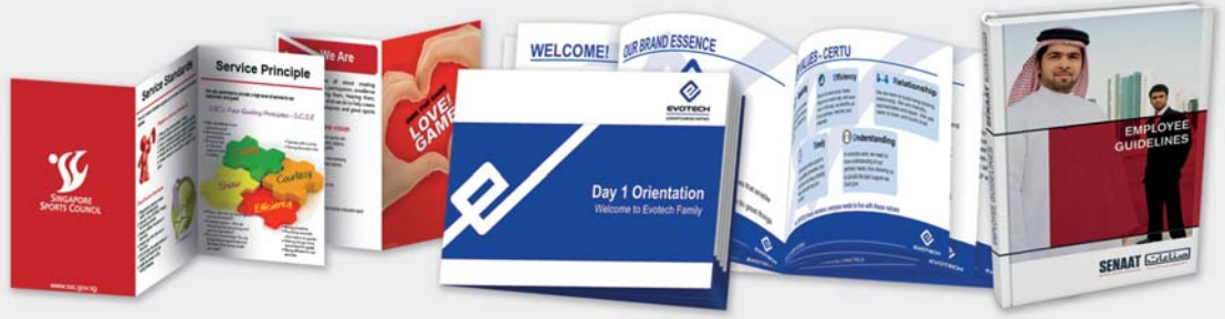
Employee Brand Book

Build strong corporate cultures with employee engagement tools that will connect and communicate your brand to your people.