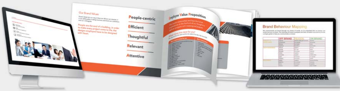
Corporate DNA Development

Create an impactful internal strategy that will align your employees to your culture while increasing loyalty and motivation