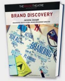
Brand Discovery Workshop