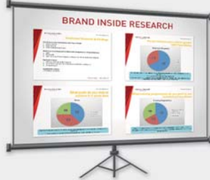
Brand Inside™ Research Tool

Listen to the voice of your employees, find out what makes them tick and discover gaps that might be holding your organisation back.